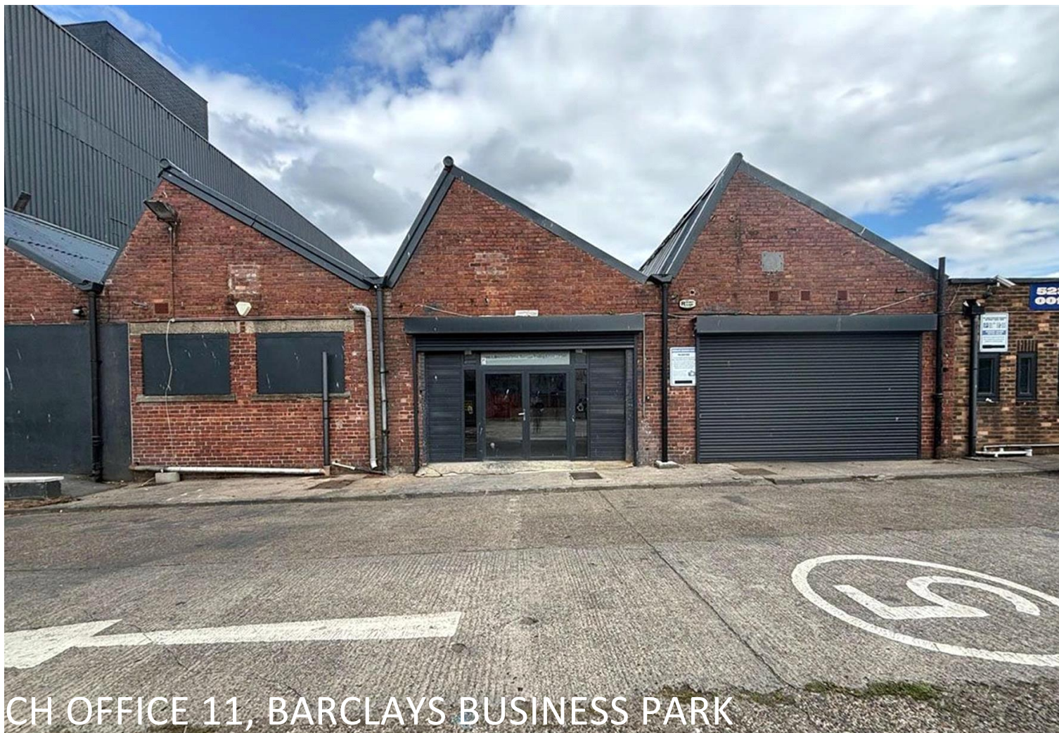
CH OFFICE 11, BARCLAYS BUSINESS PARK

Centaur and Barclay are pleased to offer for let this recently refurbished 208 SqFt office located on the popular Barclay Business Park, which is accessed via Brookfield Drive, L9. Available to view now!.