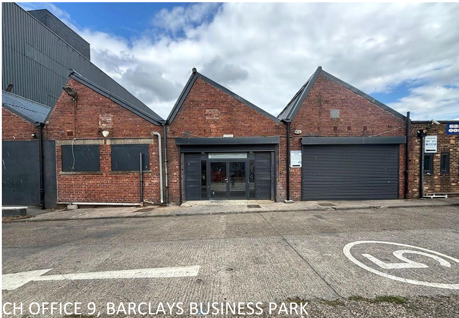
CH OFFICE 9, BARCLAYS BUSINESS PARK

Centaur and Barclay are pleased to offer for let this 186 SqFt office located on the popular Barclay Business Park which is accessed via Brookfield Drive. Available to view now!